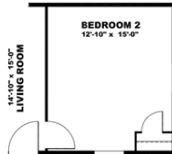
2 BEDROOM OPTION #1

Our home building facilities invest in continuous product and process improvements. Plans, dimensions, features, materials, specifications and availability are subject to change without notice or obligation. Renderings and floor plans are representative likenesses of our homes and may differ from the actual homes. We invite you to tour a Home Center near you and inspect the highest value in quality housing available or call (864) 585-2453 to speak with a Home Consultant. Copyright 2017, CMH. All rights reserved.