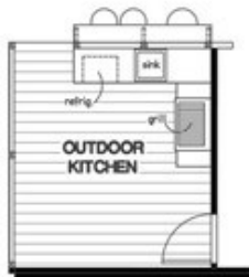
OUTDOOR KITCHEN OPTION