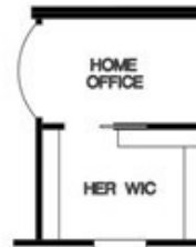
HOME OFFICE OPTION