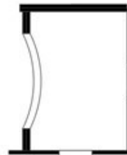
ADULT RETREAT OPT.

Our home building facilities invest in continuous product and process improvements. Plans, dimensions, features, materials, specifications and availability are subject to change without notice or obligation. Renderings and floor plans are representative likenesses of our homes and may differ from the actual homes. We invite you to tour a Home Center near you and inspect the highest value in quality housing available or call (864) 585-2453 to speak with a Home Consultant. Copyright 2017, CMH. All rights reserved.